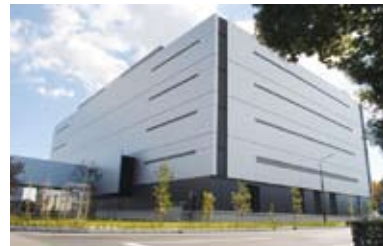
The new annex of Fujitsu's Tatebayashi System Center

The Fujitsu Group operates some 90 datacenters worldwide, with plans to increase this number in the coming years. Across the Group, we are putting a cloud computing infrastructure in place in advance of this new era to meet the anticipated growth in demand in the years ahead.