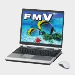
The world's first notebook PC with the main housing made from environmentally friendly bio-based plastic