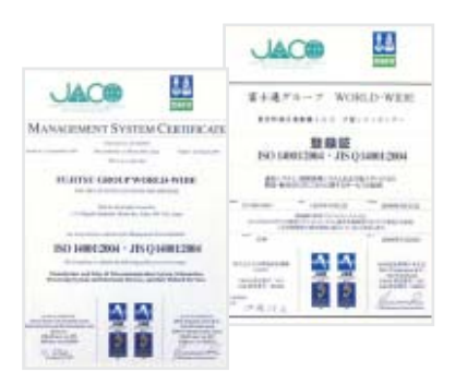
Fujitsu obtained worldwide integrated ISO 14001 certification