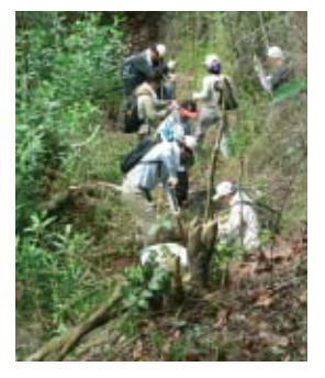
Overseas tree-planting activities