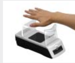
Contactless palm vein authentication system