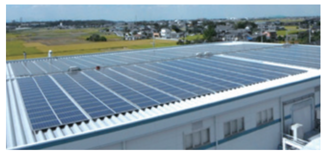
Solar panels at Fujitsu Wireless Systems Limited

In October 2013, we installed solar power generation facilities with generation capacity of 200 kW at the Kumagaya Plant, Fujitsu Wireless Systems Limited, in order to reduce our amount of power consumption and limit peak periods of consumption. We are trying out various approaches, such as spreading water on the solar panels to keep their surfaces from overheating, to maintain maximum power generation efficiency. As a result of installing the facilities, we have been able to reduce power usage at the entire plant by approximately 10%.