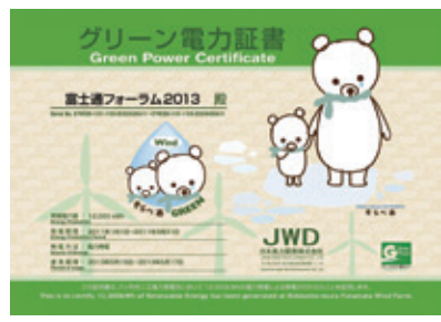
Green power certificate