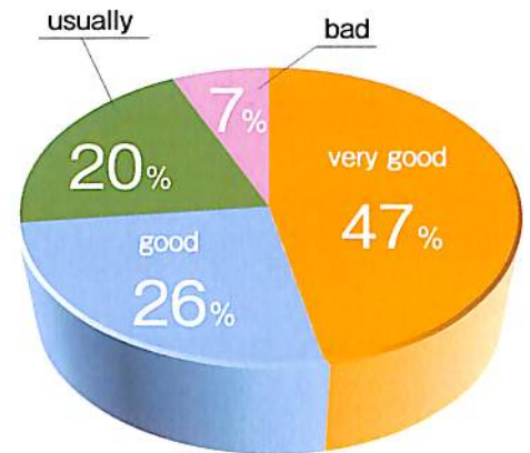
Satisfaction rating to new product

The function of software that the inspection of data is possible by the sense that turns over the file is strengthened, and easiness to use has been improved.