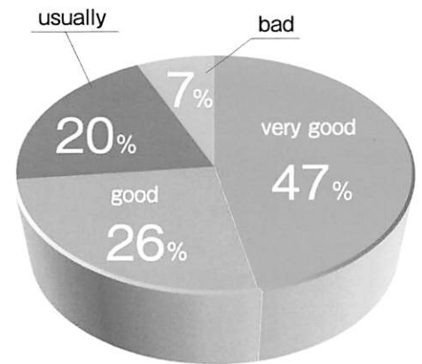
Satisfaction rating to new product

The DLM solution that used received the rise of the concern to efficient management and internal management of the corporate private circumstances report in recent years and attracted attention. The function of software that the inspection of data is possible by the sense that turns over the file is strengthened, and easiness to use has been improved.