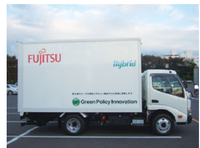
Newly adopted hybrid vehicle

Starting in November 2010, we switched over to hybrid vehicles for the trucks owned by a cooperating transportation company used solely by Fujitsu for mail and package delivery in the Tokyo metropolitan area. These vehicles, equipped with ecological tires and Fujitsu in-vehicle terminals, reduce CO 2 emissions by improved fuel efficiency.