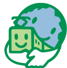
エコレールマーク Eco Rail Mark

As a result of increasing our use of rail transport, we acquired Eco Rail Mark certification as established by the Japanese Ministry of Land, Infrastructure, Transport and Tourism and the Railway Freight Association in March 2011.