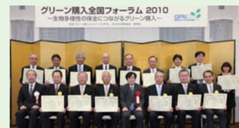
Awards ceremony at the Green Purchasing Awards

Our efforts were highly acclaimed for innovation and uniqueness. Specifically recognized were the Fujitsu Group's encouragement of its business partners to conserve biodiversity, the fact that we provided guidelines to our business partners, and that we set up an evaluation index.