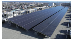
Solar panels at FDK TWICELL

FDK TWICELL manufactures rechargeable batteries and has implemented a mechanism in which solar generated electricity is used for initial charging of batteries before shipment.