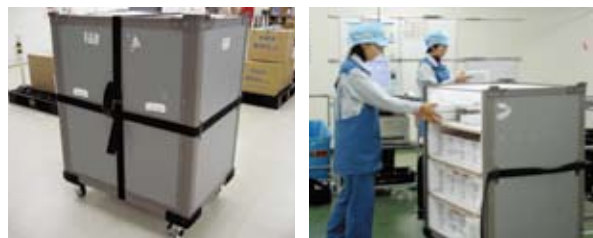
Special-purpose returnable containers for semiconductor devices and their use at Fujitsu IT Products, Ltd.

We have achieved elimination of external cardboard boxes and reuse of shock absorbing materials by using small returnable containers and a significant reduction in the use of packing materials in the shipment of semiconductor devices within the Fujitsu Group.