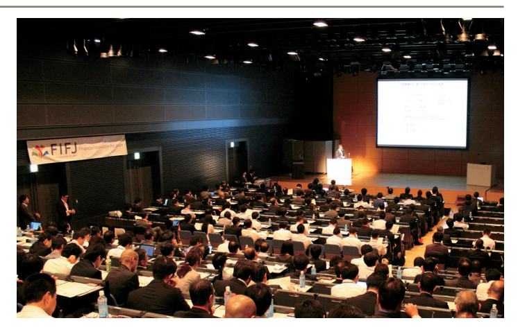
Figure 1: Main hall at Financial Innovation for Japan (FIFJ) Fall Meeting 2016

Those in the Fintech sector expect Fintech services to create added value impossible with conventional ICT alone, and to make the accompanying financial services more convenient for financial institutions and other users. Says Kumamoto, "The high level of productivity and sophistication brought about by ICT also adds new value and generates new services. As these services spread into general use, they will