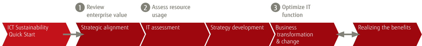
Figure 3 – Fujitsu framework for aligning IT

For further information visit: http://www.fujitsu.com/global/solutions/sustainability/