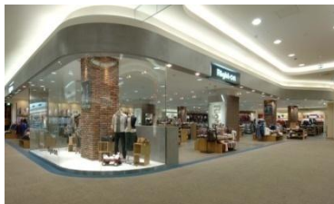
Picture. One of the Right-on stores inside a shopping mall

stores. For example, 'CHIME' is Right-on's new brand that specializes in clothes for adult women.