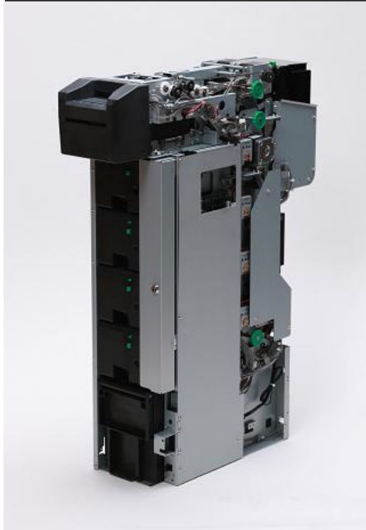
G60 Multi-Cassette Recycling