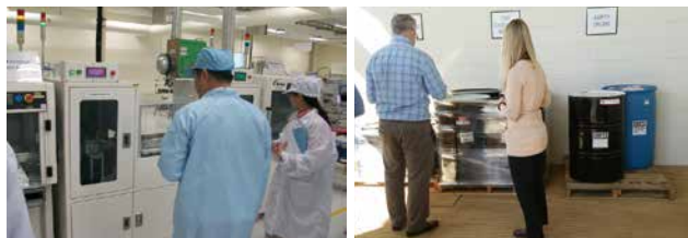
An internal audit being conducted overseas

Domestically, about one third of findings involved operational control, many of which were related to methods for managing chemical substances. Overseas, receiving cooperation from external experts thoroughly knowledgeable in local laws and regulations and operation, we carried out internal audits with the objective of strengthening compliance. Regarding the content of the findings, more than 50 percent related to "legal and other requirements" and "operational control."