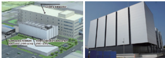
Exterior view of the Akashi System Center New facility (seismic isolation datacenter)

Outside-air is used for cooling during winter, intermediate seasons, and as much as possible in summer, while electric cooling is only used to supplement the outside-air, maximizing air-conditioning efficiency. In addition, we have developed and adopted new cooling technology (patent pending) that combines packaged air-conditioners (PAC) for general use computing rooms as supplemental cooling equipment in summer to make cooling with outside-air possible throughout the year, even in warm climates.