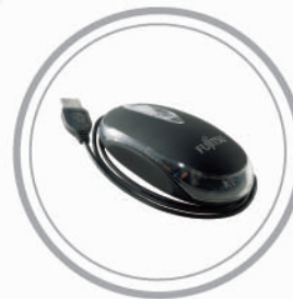
USB Optical Scroll Mouse