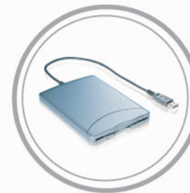
USB Floppy Disk Drive