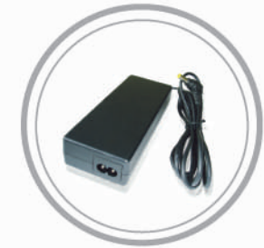
Additional AC Adapter