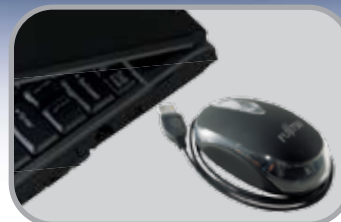
USB Optical Scroll Mouse