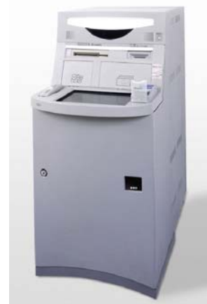
Figure 2: ATM with PalmSecure sensor unit.

The Hiroshima Bank 5 started this type of service in April 2005, followed by The Bank of Ikeda 6 in June 2005. Other financial institutions, including The Nanto Bank, plan to start similar services during fiscal 2005.