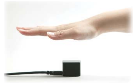
Figure 6: PalmSecure login unit.

In the early stage of introduction, the units were limited to businesses handling personal information that came under the “Act for the Protection of Personal Information” enforced in April 2005. However, use of the units is now expanding to leading-edge businesses that handle confidential information.