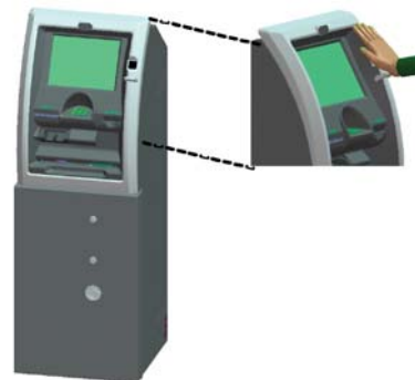
Figure 4: ATM for convenience stores with small palm vein pattern authentication sensor unit (CG design image).

PalmSecure units are used to control access to places containing systems or machines that manage personal or other confidential information, such as machine rooms in companies and outsourcing centers where important customer data is kept.