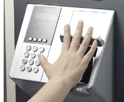
Figure 5: Palm vein access control unit.

For both of these applications, the combination of the following features provides the optimum system: a hygienic and contactless unit ideal for use in public places, user-friendly operation that requires the user to simply hold a palm over the sensor, and an authentication mechanism that makes impersonation difficult.