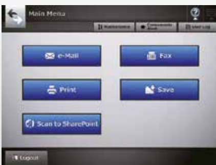
Main Menu screen

An SDK is available for the N7100 to further meet the needs of your business. This SDK will enable developing a connector to a preferred third-party application, may that be a DMS, ECM, BPM or ERP system. This connector in turn is uploaded to the N7100 and then acts as a one button door opener into the productive target systems. The SDK additionally provides for utilising IC readers attached to the network scanner's USB port.