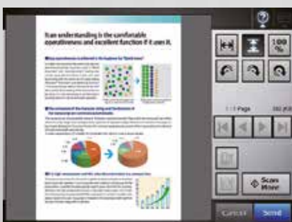
Preview screen (Scan viewer)