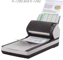
fi-7280 and fi-7260

fi-7160 / fi-7260 – A4 Portrait at 300 dpi 60 ppm / 120 ipm fi-7180 / fi-7280 – A4 Portrait at 300 dpi 80 ppm / 160 ipm Scan mixed batches through the 80 sheet ADF