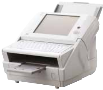
fi-6010N – A4 Portrait at 200 dpi 25 ppm / 50 ipm Scan mixed batches through the 50 sheet ADF