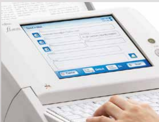
Integrated LCD operating panel

After loading documents into the scanner and logging in the user simply selects transmission mode and destination and presses the scan button. This is all that is required to scan documents to your company's unique workflow processes, network printers or to a network fax server system. Many process functions require no user intervention. Simple touch screen procedures accessed from the large colour display enable non-expert operators to capture high quality images first time - every time.