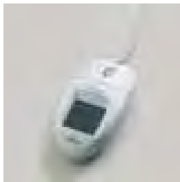
Hold palm over scanner

PalmSecure, which is the result of over 20 years of Fujitsu's research into image recognition and processing technology, is a contactless, hygienic, non-invasive system that's fast, accurate, and easy to use. Simply hold your palm a few centimeters over a small scanner, and within a second the scanner captures a near-infrared image of your unique vein pattern. A proprietary algorithm takes this image, converts it into a digitized biometric template, and then matches it against a database of pre-registered templates. If a perfect match is found, your identity is verified.