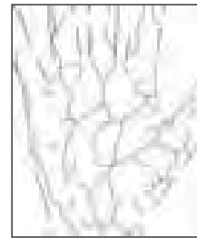
Your identity is verified