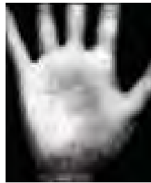
Scanner reads vein pattern