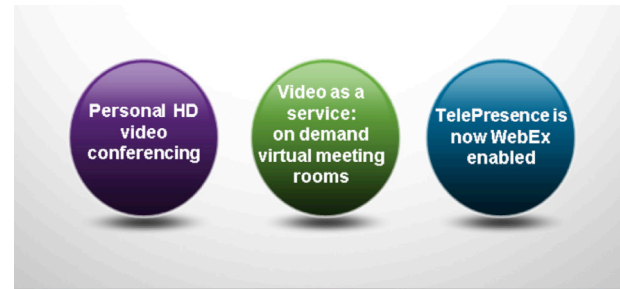
Figure 2. Delivering Business Value and Technical Innovation: Simply, Cost-Effectively, and Scalable

Cisco Pervasive Conferencing capabilities and solutions use software enhancements to deliver increased conferencing efficiency scale across premises and cloud, and new seamless conferencing experiences for Cisco TelePresence and WebEx meetings (Figure 2).