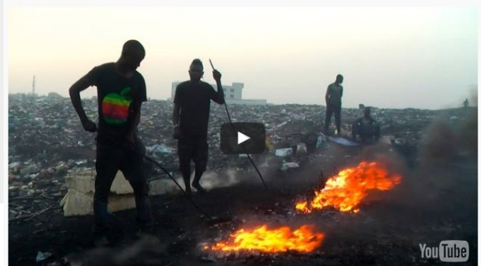
YOUTUBE: Australian e-waste found in the world's worst dump