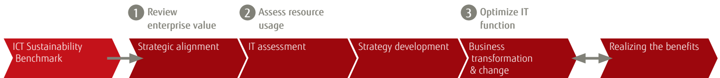
Figure 3 – Fujitsu framework for aligning IT

The ICT Sustainability Benchmark is an introductory offering based on Fujitsu’s full ICT Sustainability service. Figure 3 demonstrates Fujitsu’s full framework for helping user organizations enable business sustainability through ICT Sustainability. Fujitsu’s ICT Sustainability framework aligns your IT and business goals with your sustainability strategies and ensures that real benefits are delivered to your organization.