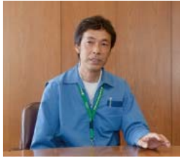
*2. Performance at Fujitsu

"Every day, I notice various things on the Environmental Management Dashboard, so I clearly understand the exhausting initiatives being take at other factories. We cannot go back to manual information collection."