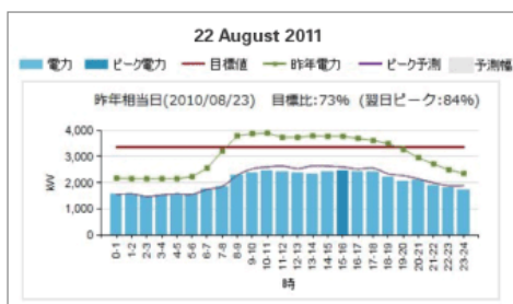
Displaying peak use predictions and hourly electric power use

Accessed by a web browser, the Environmental Management Dashboard displays predictions of demand for each day based on the state of electric power use every hour at each business facility, discrepancies from target values, comparisons with power use the previous year, and the present year's production plan. This information is used to both reach our electric power saving target and fulfill our production plans.