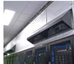
"Spot" Air-conditioning System

"We want to apply not only the functions and performance of our data centers, but their environmental performance, in order to contribute to our customers and society."