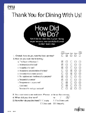
PaperStream IP Clean Up Applied