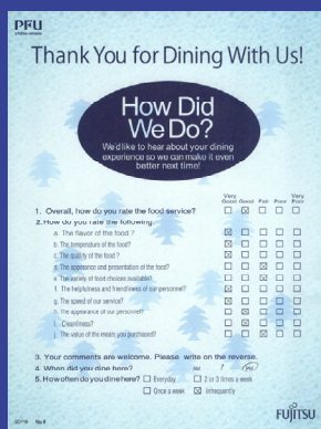
Original Scanned Document