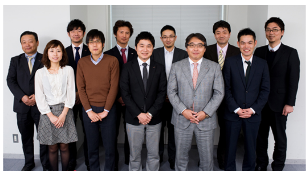
Members of the Solution Business Department, Corporate Marketing Division at NTT DOCOMO, INC.

NTT DOCOMO, INC. is striving to cultivate unlimited possibilities in mobile communications and provide future-generation services to its customers. As a trusted ICT partner of NTT DOCOMO, Fujitsu is one-hundred percent committed to providing end-to-end support to facilitate the innovations of NTT DOCOMO and help the company take on new challenges.