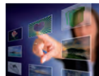
Interactive Multi Touch, Dual Touch and Gesture Touch