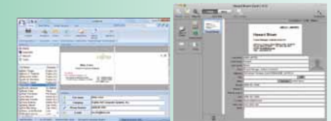
CardMinder™ V4.1 Cardiris™ 4.0 for ScanSnap

The S1300i comes with high-value business card management applications that store digitized business cards and encode the text data for applications like Address Book (Mac), Excel® (Win), e-mail, databases and more.