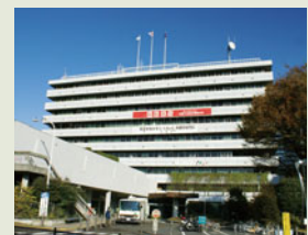
Nakano Ward Office

Nakano Ward in Tokyo, a local government authority with sophisticated use of IT, has introduced our 'IPKNOWLEDGE' internal information system into its ward office, and is using it to improve its working efficiency and reduce its environmental