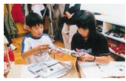
Sapporo City Ainosato-Higashi Elementary School 3rd Educational Practice Presentation Meeting

We support integrated environmental studies from elementary to high school under an original program in our capacity as a corporation employing new eco-friendly materials, research and product development. Students use actual products to study the relationship between parts and the global environment.