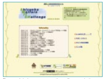
The "e-switch" homepage supporting welfare organizations

Established in 2001, this club has sponsored various support programs designed to teach elderly and physically challenged residents of Shizuoka Prefecture to operate PCs and other IT devices. The club also operates a home page, "e-switch," to assist welfare organizations in Shizuoka Prefecture in disseminating information.