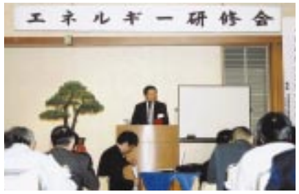
A lecture on implementing environmental preservation activities

As part of an information-sharing effort close to the local community, Fujitsu Yamagata held lectures for local governmental bodies and companies on the subjects of zero emission activities and environmental conservation measures for implementation at plants.