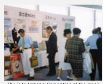
The 55th National Convention of the Japan UNESCO Movement in Okayama