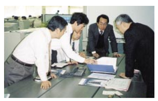
An audit in process (Kawasaki site)