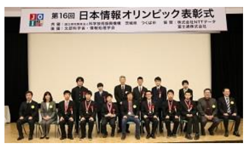
The 16th International Olympiad in Informatics awards ceremony

Fujitsu supports the Mathematical Olympiad Foundation of Japan and the Japanese Committee for the International Olympiad in Informatics (the latter being a non-profit organization) to help discover and foster valuable human resources who will play leading roles in the future development of society. The Mathematical Olympiad Foundation of Japan was established in 1991 in order to discover gifted mathematicians for selection and entry as national representatives in the International Mathematical Olympiad (IMO) and to further develop their skills. The foundation is also committed to helping improve and promote education in mathematics from an international perspective. Fujitsu provided the basic funds for the establishment of the Foundation along with two other companies and one