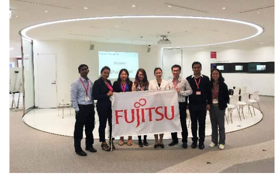
Fujitsu Scholarship Recipients

Every year, Fujitsu receives many applications for its scholarships. Scholarship recipients are selected based on criteria that include English language skills and work experience, as well as a desire to make a contribution to their home country. Through efforts that include joint-recruiting programs, Fujitsu is working with Fujitsu Group companies doing business in the Asia-Pacific region to provide scholarships to people considering helping their country or community, and contribute to society by providing education rooted in local communities worldwide, aimed at developing business leaders and promoting cultural exchange and mutual understanding.