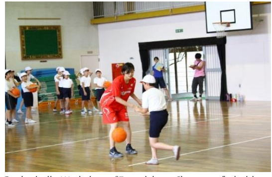
Basketball Workshop "Friendship Classroom" held in FY2016 at an elementary school in Kawasaki City.

As part of Fujitsu's social contribution activities and to encourage sports in the local community while building up the foundation of Japan's basketball world, the team has been recognized as a Hometown Sports Partner by Kawasaki City where the team is based, and it provides coaching in basketball workshops it conducts for elementary school students in Kawasaki City during PE classes. The team has conducted these workshops for 12 consecutive years since 2004, with 10 workshops conducted in FY 2016.