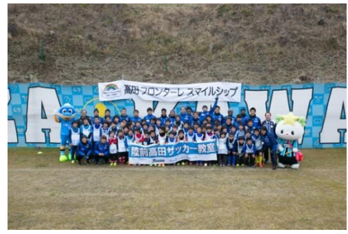
Soccer class held in Rikuzentakata in FY 2016.