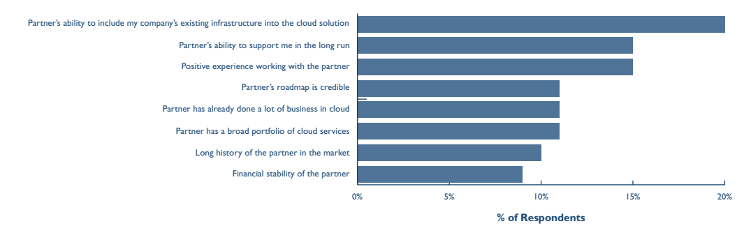
Figure 3: Top Factors for Trusting a Cloud Partner

But how do you choose a partner or partners you can trust? Figure 3 shows the top-ranked factors that IT decision-makers use in determining the type of service provider they would trust to be their primary cloud partner.