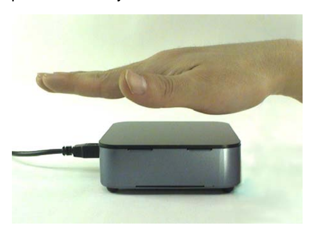
Contactless palm vein recognition unit

Fujitsu's new technology is a combination of a device that can read the pattern of blood vein patterns in the palm without making physical contact (see photo) and software that can authenticate an individual's identity based on these patterns. Infrared light is used to capture an image of the palm as the hand is held over the sensor device. The software then extracts the vein pattern and compares it against patterns already stored in the database.