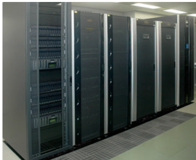
Unix server SPARC Enterprise and Storage ETERNUS

AIST's Packaged Development Framework goal is improvement of organizational activities in public and private institutions. At a first step, in creating the new mission critical system, AIST chose this framework to resolve system problems and raise research efficiency. Obviously the supporting database server at the core of the mission critical system is required to have high scalability as well as high reliability and performance.