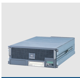
Rackmount (4U) Compute node