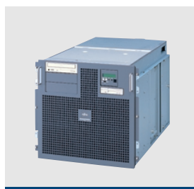
Rackmount (10U) Application engine