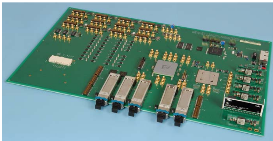
Reference design for 10 Gb Ethernet mapping applications.

The MB87Q2091-DK provides a quick and easy means to become familiar with the MB87Q2091 10G Ethernet LAN-PHY Mapper in its multiple configuration modes. Since the MB87Q2091 is generally used in conjunction with a 10Gbit/s FEC device for DWDM and long-haul applications, the IXF30009 10G FEC device from Cortina Systems, Inc ® is included on the evaluation board. Software to configure both devices via a PC, is part of the development kit.