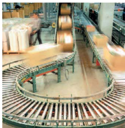
The 2kBytes/256Bytes embedded FRAM enables high-speed data writing, with up to 10 10 write cycles.

'FRAM' (Ferroelectric Random Access Memory) is a non-volatile memory technology with the unique features of high-speed, low-power writing operations, high re-write endurance and strong tamper resistance. It is ideally suited to RFID, smart cards and contactless applications, as well as many applications where SRAM (Static RAM) are used with expensive batteries. Due to its resistance against radioactive radiation, FRAM fits into medical applications and applications in the food industry where sterilization is performed by irradiation.