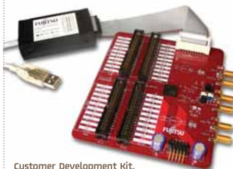
Customer Development Kit.