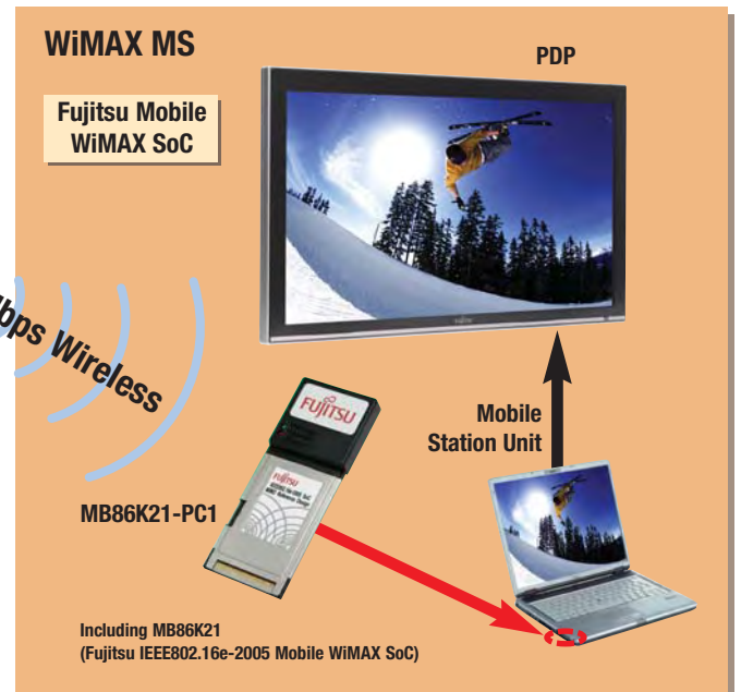
Demonstration shows video stored in server being streamed to the PC through Fujitsu's mobile base station and broadband SoC used in a mobile station.