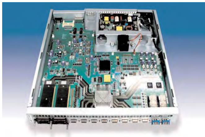
The reference board featuring Fujitsu's MB8AA3021 10GE switch.