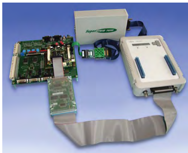
Emulation system set-up.