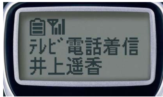
Figure 4 Rear sub-display.

The sub-display on the back is of a landscape 1.2-inch monochrome type (STN monochrome LCD) that can show large characters and is easy to read even when the backlight is off due to time-out ( Figure 4 ). The high contrast set between displayed characters and the background enhances visibility.