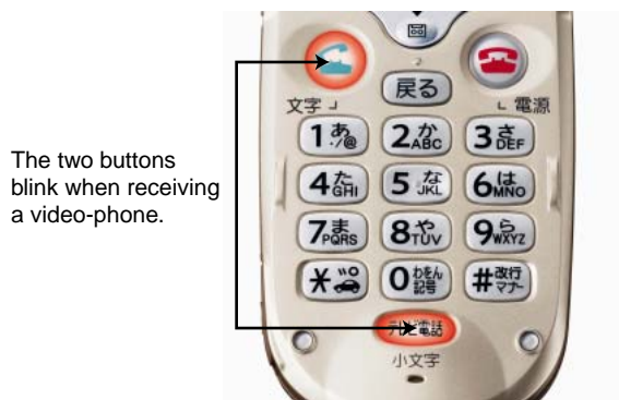
(b) Light navigation feature