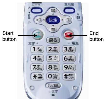
(a) Easy-to-use and easy-to-find buttons