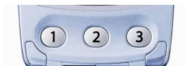
(c) One-touch dialing buttons