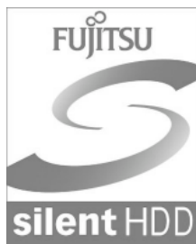
Figure 1 Logo for Fujitsu's silent HDD

The silent HDD technology uses fluid dynamic bearing (FDB) motors, which greatly reduce non-repeatable run-out (NRRO), offer improved reliability in harsh environments, and greatly reduce acoustic noise ( Figure 1 ).