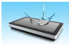
Three-Piece Metal Housing and IP65 Dust & Water Proof Display Front