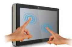
True Flat Resistive Gesture Touch True Flat Projected Capacitive Multi-Touch