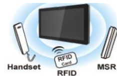
Optional Accessory Includes MSR, Smart Card Reader, RFID, Scanner, Handset