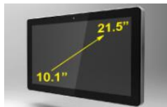
Full Range of Display Sizes 15.6", 18.5" and 21.5"